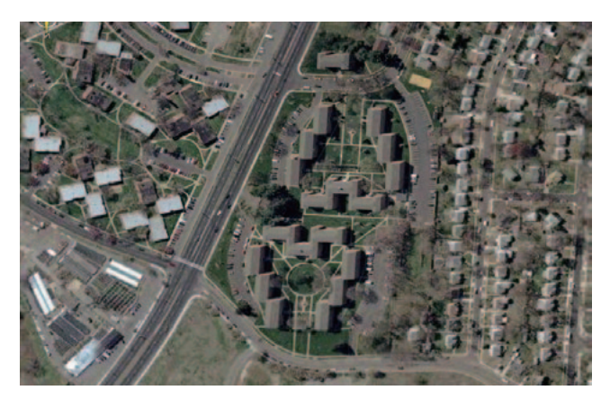
Figure 2. Examples of TOD implementation in Prince George's County, Maryland, USA

transportation. Well-known features of TOD include urban development within walking distance of transit stations, high residential density, and high functional diversity, but underlying this a geographical layout are a variety of systems that aim to improve quality of life and social justice.