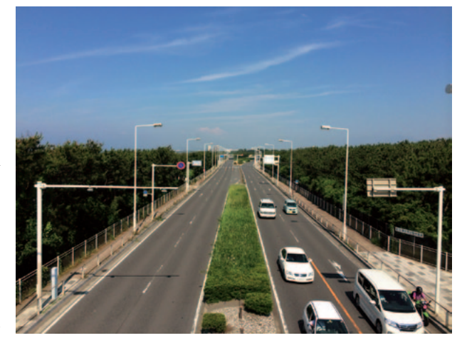
Figure 1. Current National Highway Route 134 (taken by the author in June 2014, near the Hamamiyama Kobanmae intersection)

nated for automobile use only. This was done to allow automobiles to travel at higher speeds than horse-drawn carriages, as exemplified by the development of the Long Rheinland State Parkway in the 1930s.<sup>8)</sup> Parkways later began to spread throughout the world in various forms, such as national park roads and pay roads through scenic areas. American-style parkways were soon introduced into Japan, starting with the Shonan Coast Park Road (now part of National Highway Route 134), which began construction in 1931 and was completed in 1936, as the first parkway in Japan<sup>10</sup> (Fig. 1).