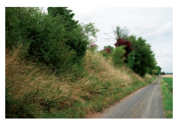
Figure 2. Railway embankments are an important habitat for the endangered sand lizard ( Lacerta agilis ) (taken by the author in July 2014, in Wetterau, Hessen, Germany)

Environmental mitigation is involved in all forms of development not just transportation infrastructure, but continuous linear developments such as roads and railways are characterized by the potential to divide organism habitats. This results in loss of habitat, as well as animal deaths due to vehicle collisions