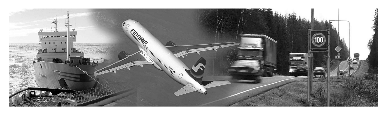
VTT carries out transport research in all transport modes.

VTT uses the latest information technology when developing production-oriented information systems supporting decision-making for the optimal control of transport. Methods related to systems research are used at the strategic, tactical and operative levels. Fleet management (FM) is applied in a physical network, where vehicles move following a given task list.