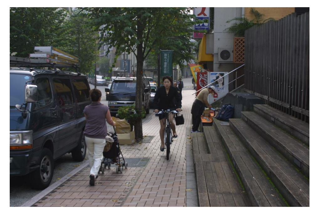
There is not even a safe place for people to ride bicycle.