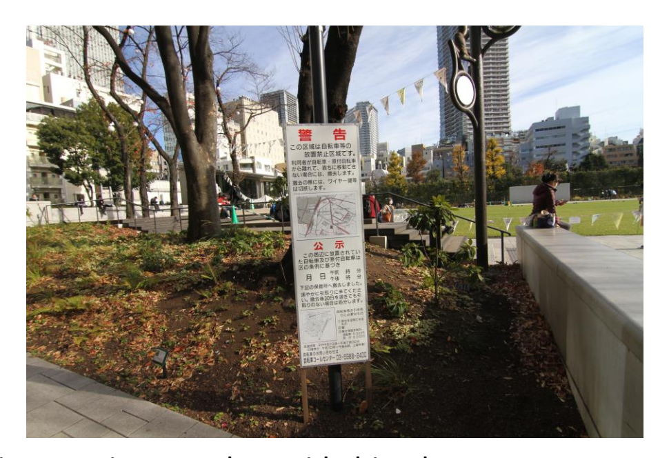
However, the government has been discouraging people to ride bicycle.