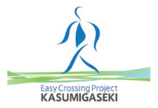
Figure 3. The public relations logo

We conducted the following two investigations to measure the effects of the experiment: