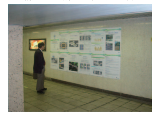
Figure 4. Explanatory panels were displayed at three locations in the station