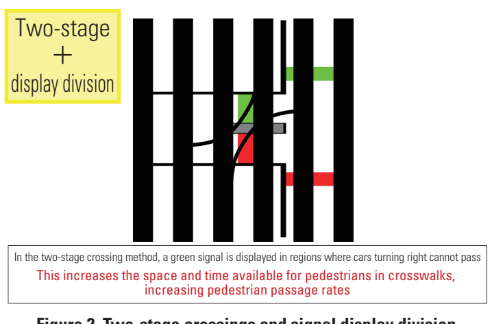
Figure 2. Two-stage crossings and signal display division

we installed two-stage crossings at the Kasumigaseki 2-chome intersection in downtown Tokyo, Japan.