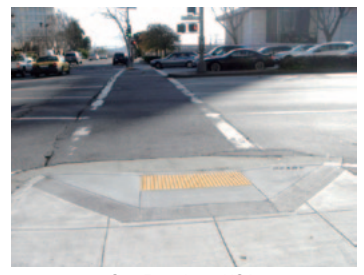
San Francisco, USA