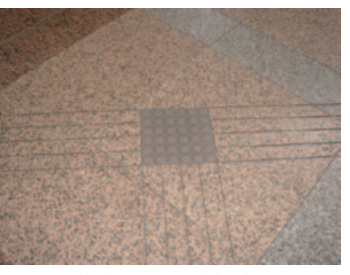
Kuala Lumpur, Malaysia