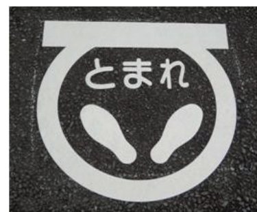
Figure 3. A stop mark

We were able to see results in post-interviews with school personnel, but for only a few months after the experiment, and thus were not able to observe improvement of students' understanding beyond that. However, we expect that continued education will result in students' increased learning of traffic rules.