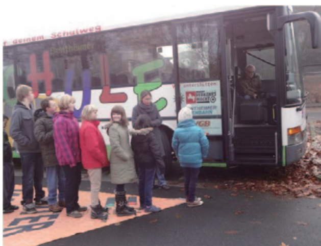
Figure 2. Explaining how to ride the bus to school

MogLi is a research project supported by the German Federal Ministry of Education and Research related to mobility for the intellectually handicapped. The project targets special needs schools in the town of Nordhorn and their students. The project began an experimental attempt to utilize chartered buses for students, in which bus operators and local police serve as guides. After verification experiments were complete, the system was put into place, and guided busing is now performed on a regular basis.