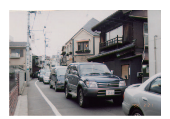
Figure 1. Motor vehicles using residential roads as a shortcut

The Yanaka district in Taito ward, Tokyo, has a population of approximately 10,000 people. The district is notable for containing many temples and wood houses from the Edo period and earlier. The district faces traffic problems such as narrow streets that have become shortcuts for cars traveling at excessively high speeds, as well as disaster prevention problems caused by stretches of wooden housing along narrow streets, resulting in the district being classified as a potentially dangerous area in terms of disaster prevention.