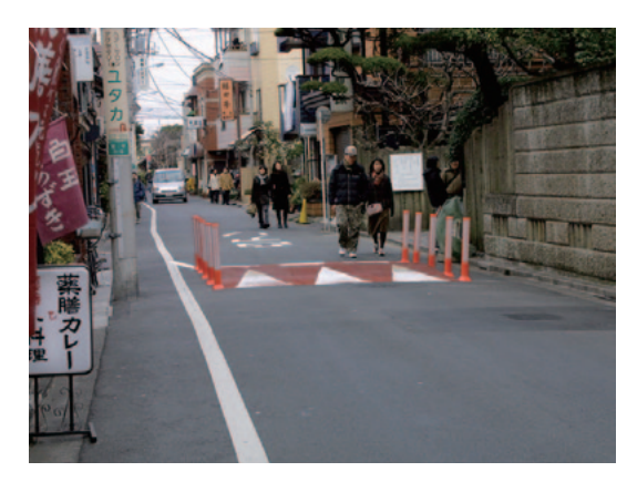
Figure 4. An experimentally installed rubber speed hump. Such experiments allow area residents to experience and evaluate impacts and effects. Noise and vibration is suppressed by the speed hump's sinusoidal shape.

From this, a pilot survey with resident participation was performed, in which speed humps were