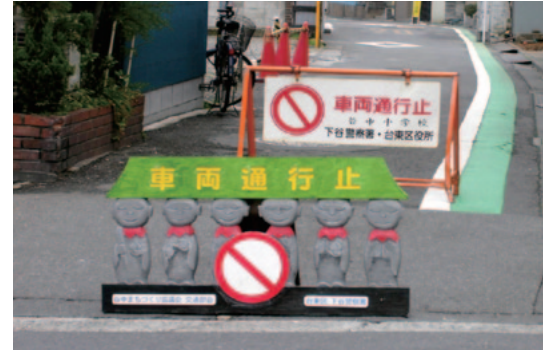
Figure 5. A traffic bollard produced based on ideas from children

residents responded "I think it is good" or "I think it is somewhat good" regarding the bollards, but this does not necessarily indicate dissent; most responses were "no response," "no opinion," or "I don't know."